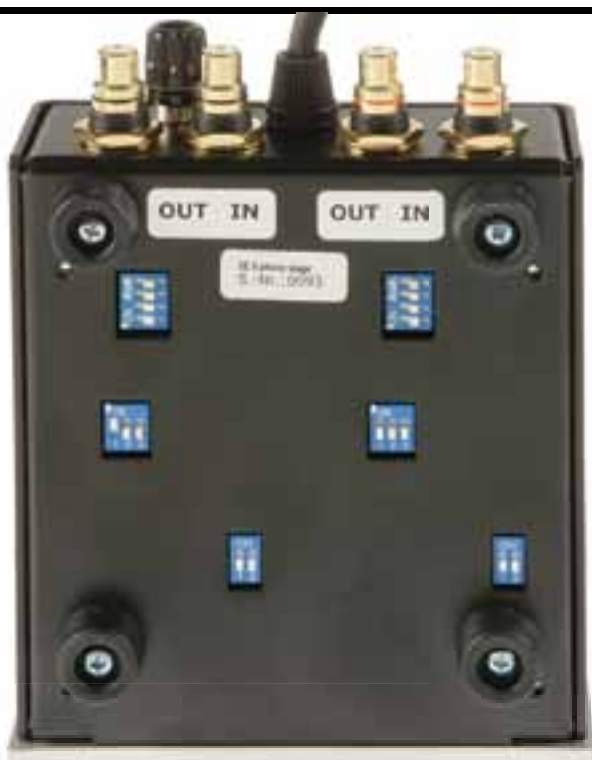
LEFT: Three pairs of DIP switches act in combination to select between four gain settings (between 36-66dB) and a choice of 16 different bass rolloff frequencies extending from 7Hz to 90Hz [see Lab Report, opposite]

Lehmann offers numerous low frequency response options for the Black Cube SE II, with its default setting (a specified 7Hz corner frequency) rolling off to -1.1dB/20Hz. The 23Hz, 30Hz and 47Hz options reach 20Hz at -4.5dB, -6.1dB and -8.9dB, respectively [see Graph 1, below]. The last of these represents quite a substantial LF roll off which contrasts with the extended ultrasonic response of the preamp, reaching out to +0.2dB at 100kHz. Few cartridges are capable of reproducing anything close to this bandwidth, Ortofon's Cadenza series being a notable exception. Readers are invited to view a QC Suite test report for Lehmann's Black Cube SE II MM/MC phono amp by navigating to www.hifinews.co.uk and clicking on the red 'Download' button. PM