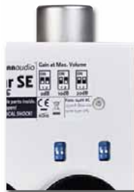
Via the dip switches the gain factor can be raised by up to 20 dB, e.g. for magnetostats

from Maria Tebaldi to Willy de Ville with a gracefulness that challenged the valve for the top dog role in its supreme discipline. We had expected that, owing to its potent output stage, it would not only consort better with the Sennheiser than its rival in terms of coarse dynamics, but also with the magnetostatic model from HiFi Man. However, the fact that it was playing the music with the same ardour, drawing the confines of the room by no means tighter, did surprise us after all. The lightness and precision with which the speaker cones dished out extremely powerful bass tran-