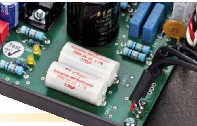
Among the high-grade components on the pc board there are also several capacitors from the Cologne-based specialist Mundorf