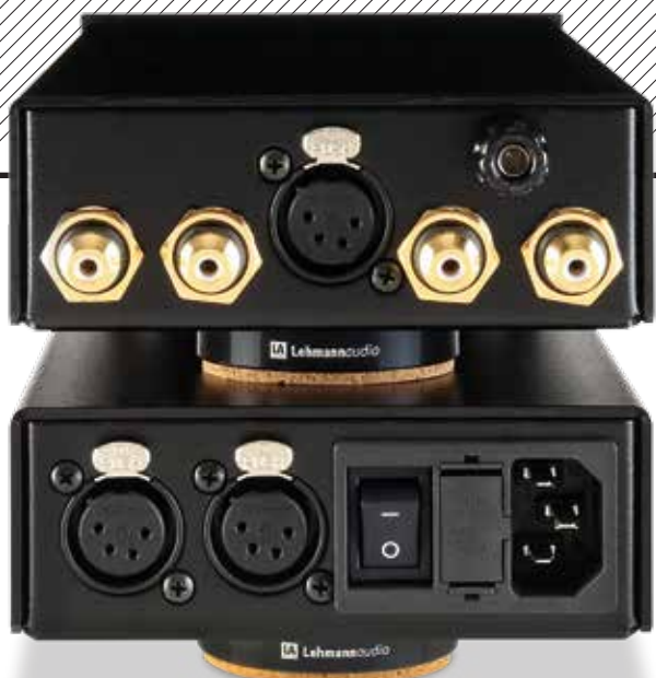
LEFT: The PWX II LC power supply [bottom], connects to the Jubilee phono stage [top] via an umbilical and 4-pin XLR plugs. A second power outlet is also provided

as it does affect low-end output noticeably; conventional rumble filters are far more subtle in their action. Really, if you need the Decade Jubilee's filter to assuage any bass issues, then you have more serious arm/cartridge matching problems to investigate.